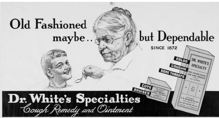
Exhibit Preview Party

The Little Compton Historical Society invites you to their annual